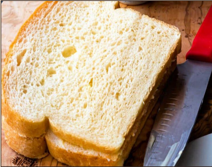
BREAD BUTTER SANDWICH